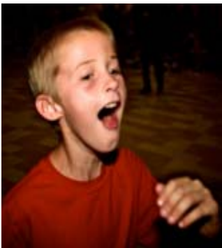
Chili was a little too hot for this little guy.